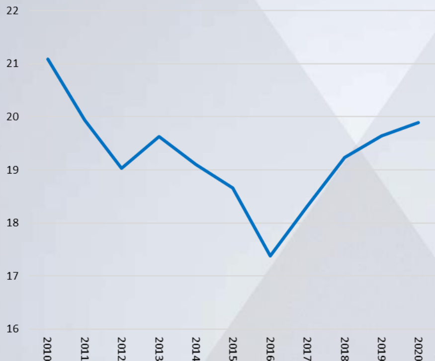
Gross fixed capital formation in % of GDP