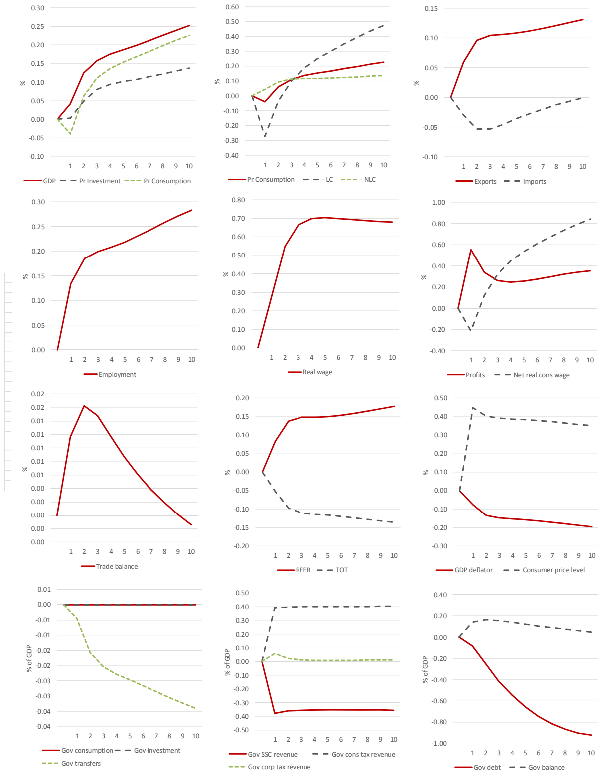
Graph 3. Responses to an increase in VAT matched by a reduction in social contributions