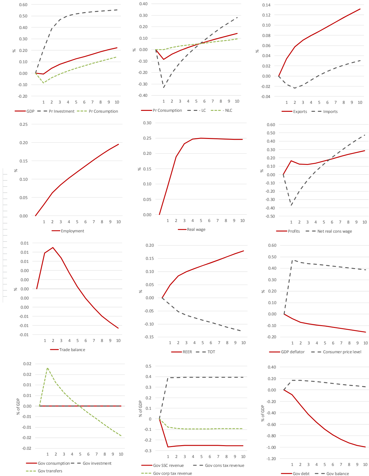
Graph 5. Responses to an increase in VAT matched by a reduction in social security contributions and the corporate income tax and an increase in transfers