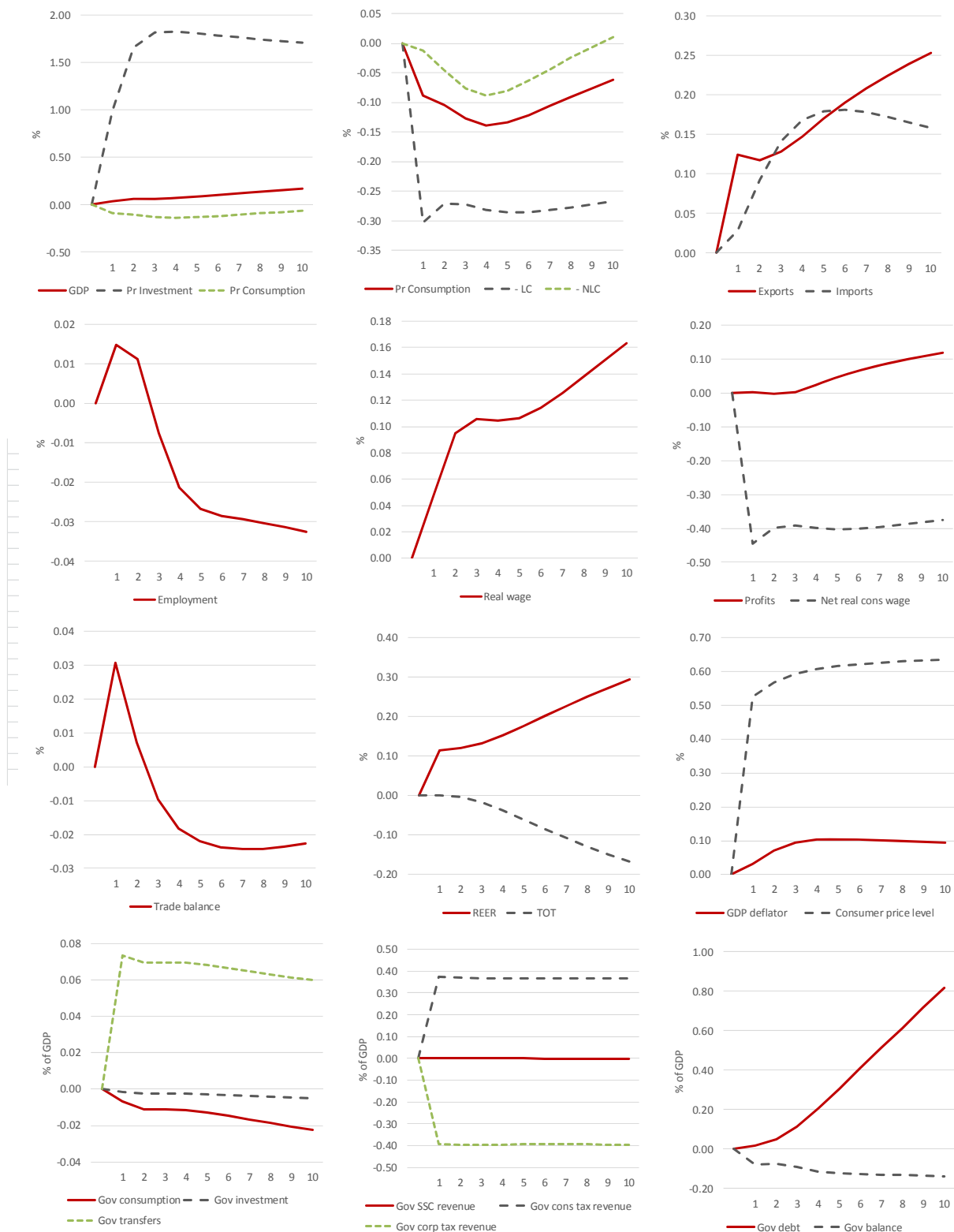
Graph 4. Responses to an increase in VAT matched by a reduction in the corporate income tax