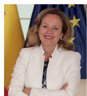
Minister of Economy and Business, Spain @NadiaCalvino

Born in 1957, Mr. Moscovici holds a master's degree in economics and political science and a postgraduate degree in economics and philosophy. He is also a graduate of the École Nationale d'Administration.