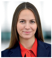
Member of the European Parliament @EvaMaydell