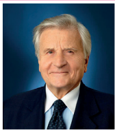
Former President, European Central Bank

He is the author of several books and scientific publications. In November 2014, Valdis Dombrovskis was awarded the Order of the Three Stars ( Triju Zvaigžņu ordenis ), the highest State Decoration of the Republic of Latvia.