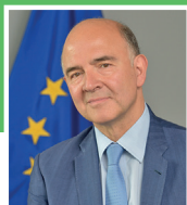
Commissioner, European Commission @pierremoscovici