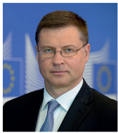
Vice-President, European Commission @VDombrovskis