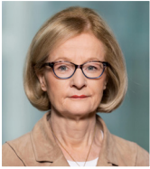
Chair, Supervisory Board, Single Supervisory Mechanism, European Central Bank