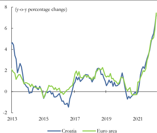
Graph IV.1: HICP Inflation

However, given the currently high uncertainty surrounding the inflation outlook, Croatia's successful integration into the euro area will require the continued monitoring of several upside inflation risks. Long-term inflation prospects will depend in particular on wages growing in line with productivity. Investments and reforms related to the implementation of the Recovery and Resilience Facility (RRF) could also be important drivers of future price developments. On the one hand, recovery and resilience plan (RRP) investments will boost aggregate demand in the economy. This could put upside pressures on prices in the short term. On the other hand, many reforms (reduction of the administrative burden and para-fiscal charges, the deregulation of services etc.) should enhance market competition and reduce costs for companies, exerting downward pressures on the prices of final products in the long term.